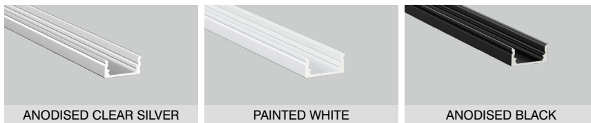
ANODISED CLEAR SILVER